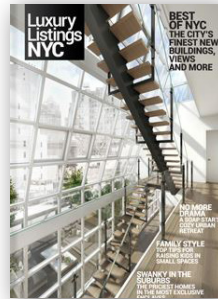
SCENE Magazine Circulation 120,000