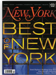
New York Magazine Circulation 400,000